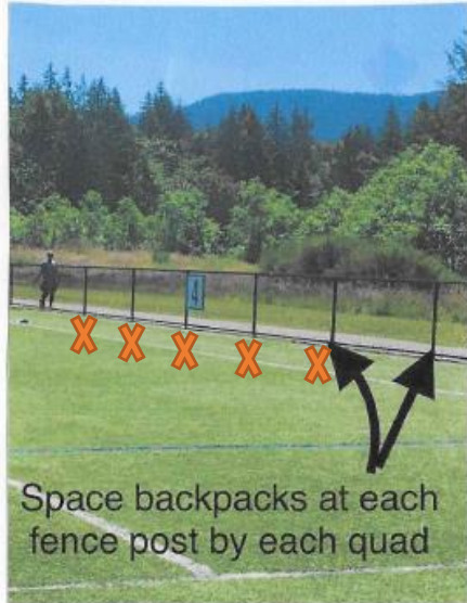
Space backpacks at each fence post by each quad