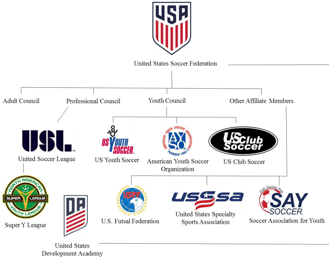
Figure 1: Youth Soccer Landscape Big Picture

Within US Youth Soccer, the country is divided into four regions comprised of Member State Associations. Region I is referred to as the East Region, Region II is referred to as the Midwest Region, Region III is referred to as the South Region and Region IV is referred to as the West Region (See Article VIII of the US Youth Soccer Bylaws). Please see the following figure (Figure 2).