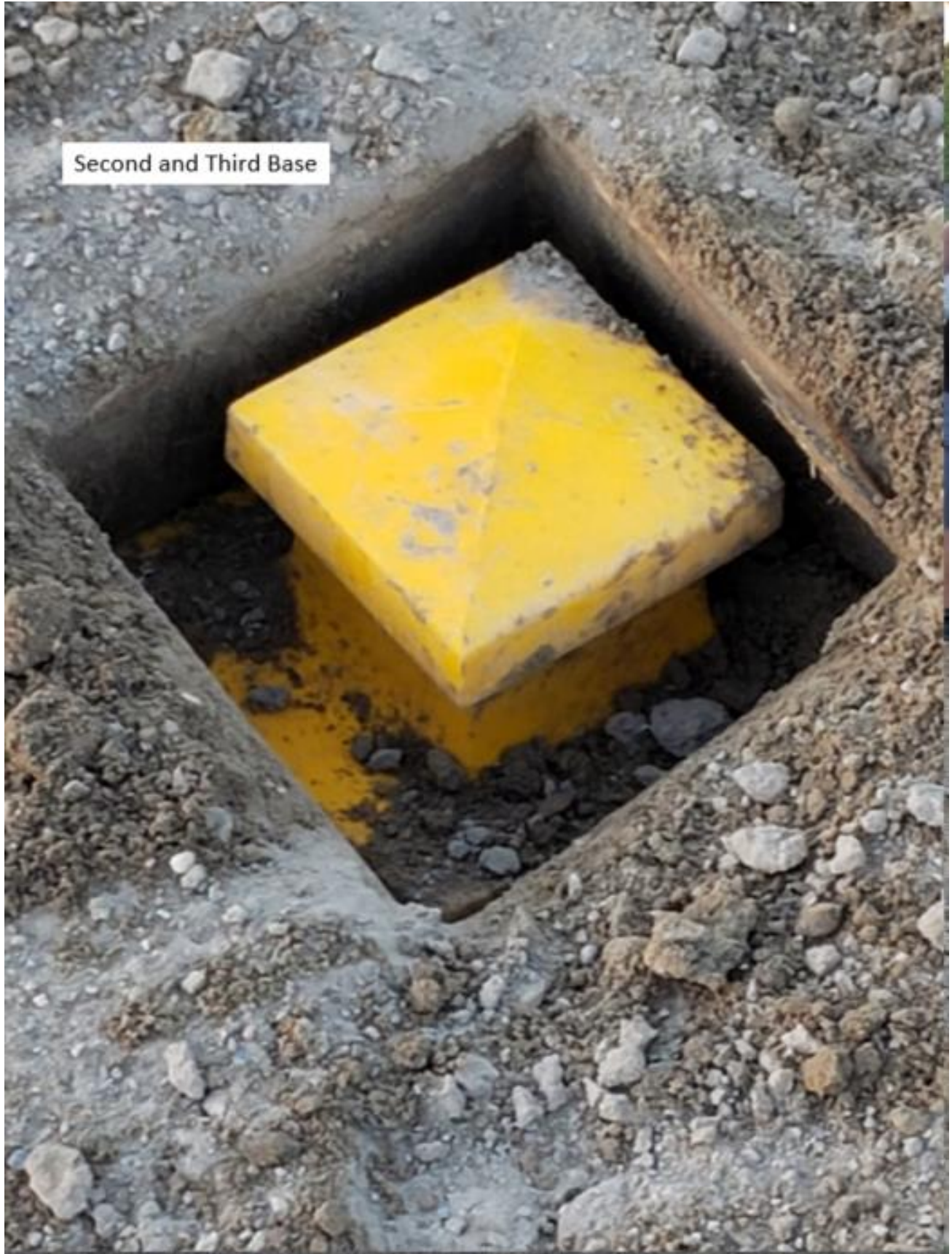
Second and Third Base