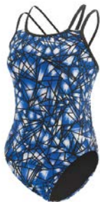
Dolphin Fracture: Girls $55.00

Start to Finish Sportswear will once again be providing our team suits. There will be two fittings prior to the start of the season. At these fittings swimmers can try on suits to get the correct sizing and order directly from the store. Suits ordered at the fittings will be delivered to and distributed by the team.