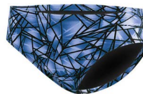
Dolphin Fracture Racer: $30.00