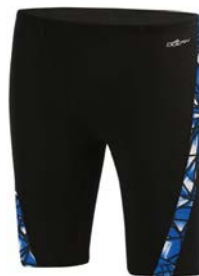
Dolphin Fracture: Boys $35.00