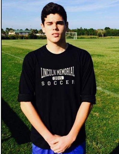
Lincoln Memorial University Harrogate, TN