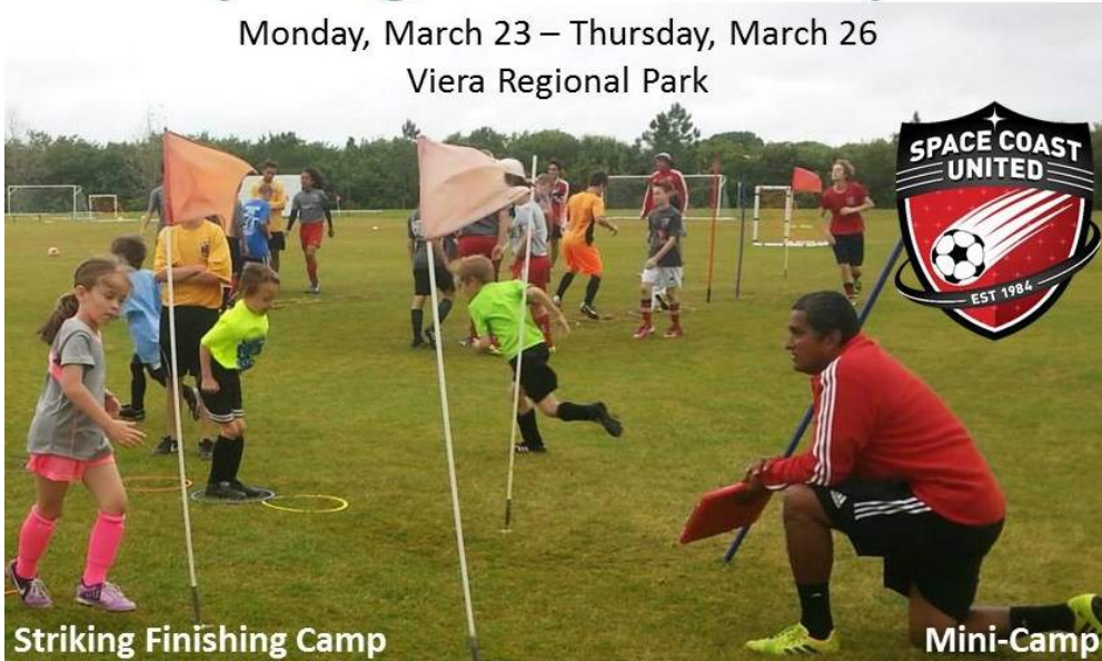
Striking Finishing Camp

Monday, March 23 – Thursday, March 26 Viera Regional Park