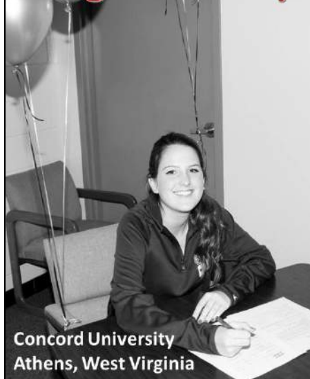
Concord University Athens, West Virginia