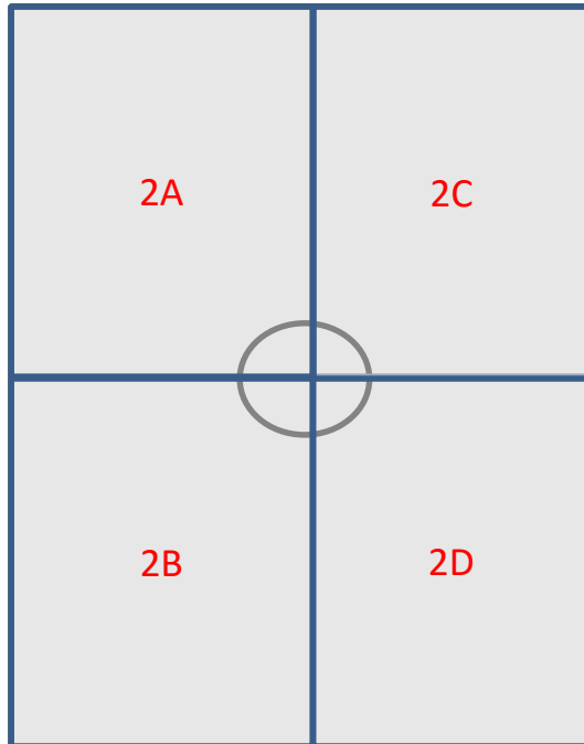
Field 2 U11-12